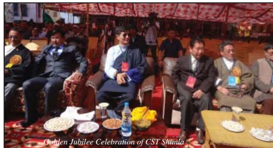
Golden Jubilee Celebration of CST Shimla